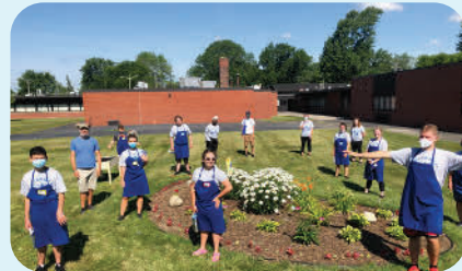
THE NONPROFIT CENTER AT PARE